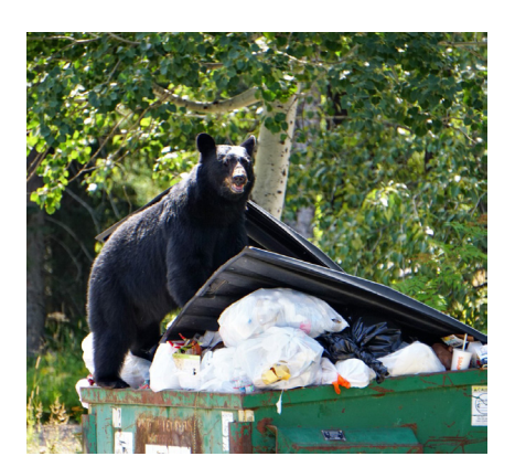
Do not overload containers, see page 5 for what to do with extra waste.