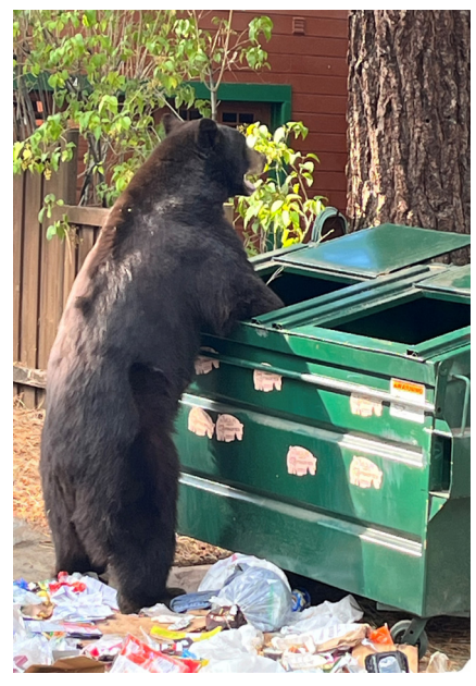
Always make sure container lids are closed and locked.