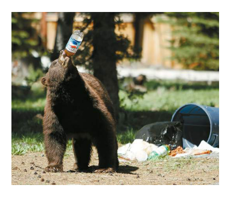
Do not put containers out the night before, containers should be out by 7 am.