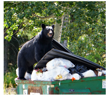
Do not overload containers, see page 5 for what to do with extra waste.