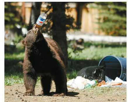
Do not put containers out the night before, containers should be out by 7 am.