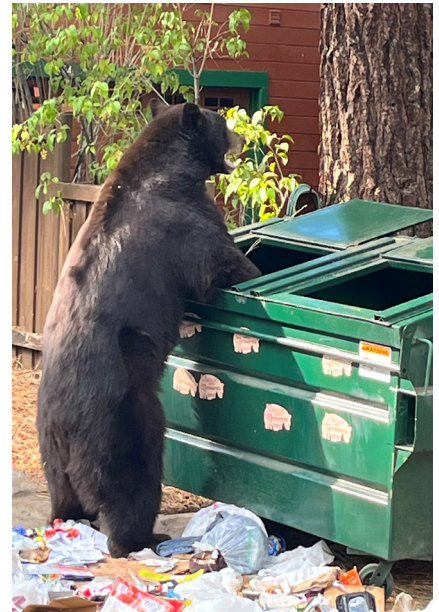
Always make sure container lids are closed and locked.