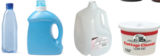
Plastic containers #1, #2, & #5 only.